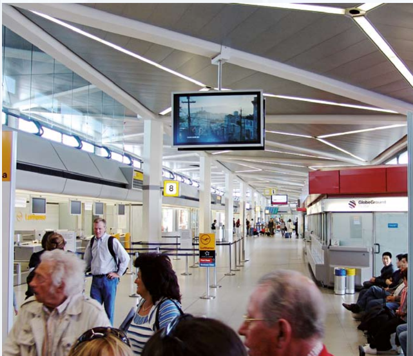
Tegel Airport Berlin / Germany