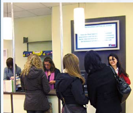
Book shop Huebscher, Kulmbach / Germany