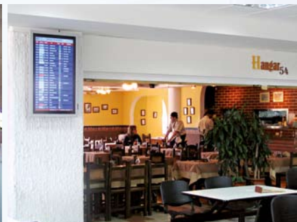
Bogota Airport / Colombia