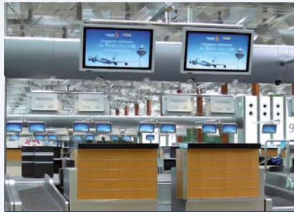
Changi Airport / Singapore