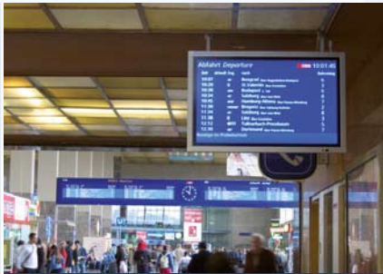
Vienna Train Station / Austria